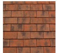
Albury (sanded) Code: 10001992