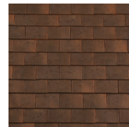
Victorian Code: 10001993