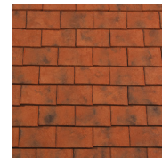
Hawkhurst (sanded) Code: 10001991