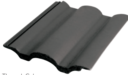
Through Colour Slate Grey

Traditionally shaped, the Taunus concrete tile provides a striking, bold effect that blends into both historical and modern environments.