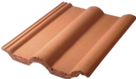
Through Colour Terracotta

Our Double Roman roof tile is a classic for the subtle and timeless design.