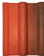
Classic Burnt Red