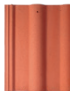
Through Colour Red