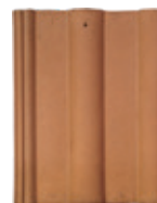
Through Colour Brown