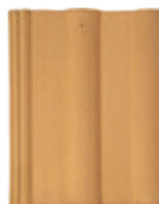
Through Colour Kalahari