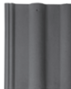
Through Colour Slate Grey