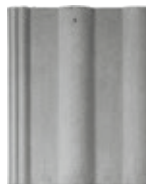
Through Colour Victorian Grey