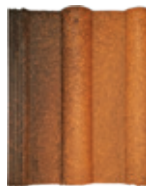
Classic Burnt Orange