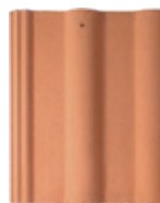
Through Colour Terracotta