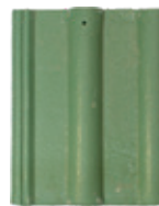
Classic Moreland Green