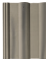
Farmhouse Victorian Grey